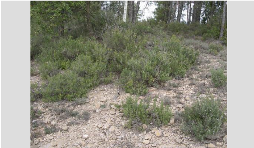
Rosmarinus officinalis (Rosemary) wild population