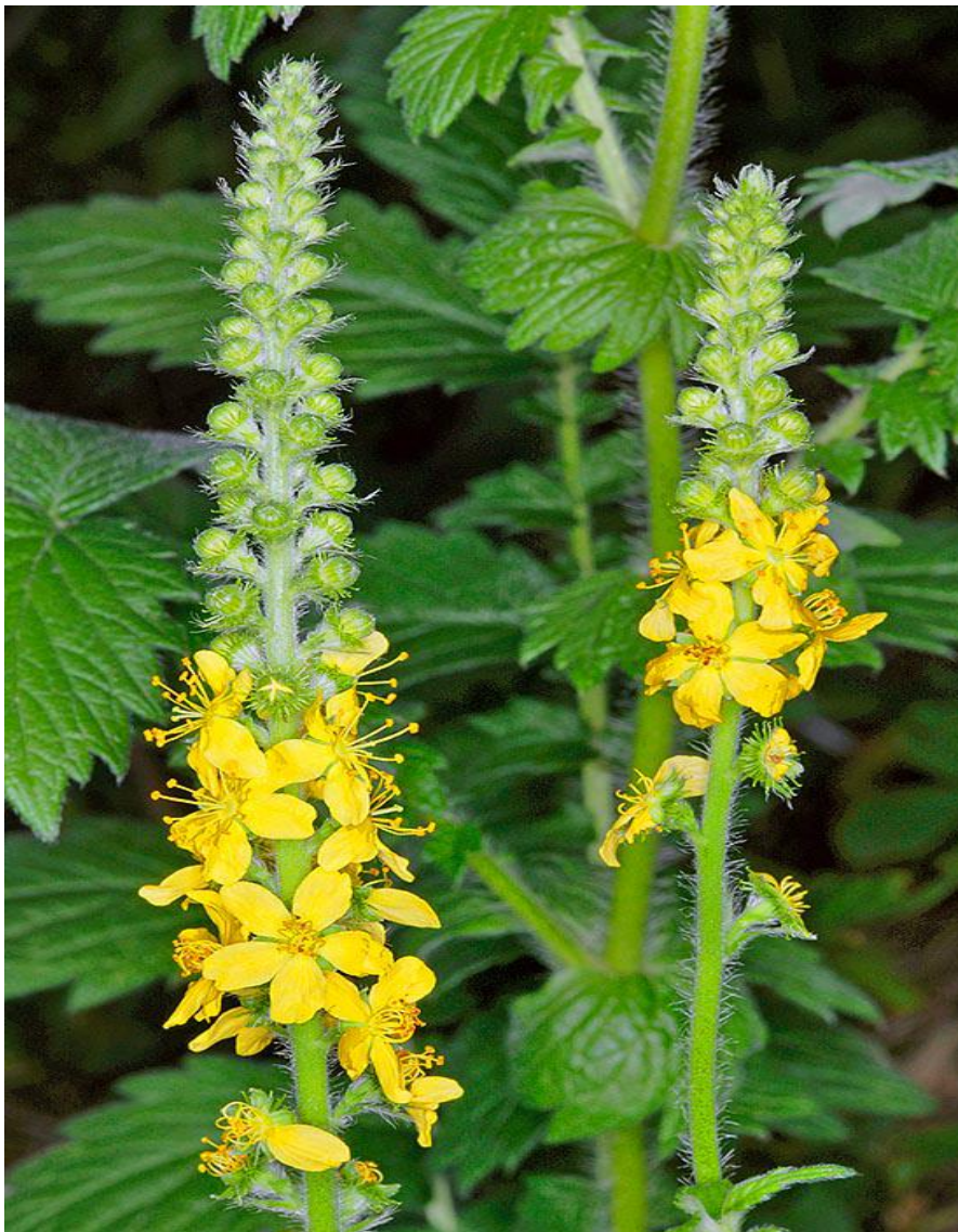
Agrimonia eupatoria , https://www.monaconatureencyclopedia.com/agrimonia-eupatoria/?lang=en

In the study area, 12 plant species were collected (13.64% of the total collected and 20.34% of the isolated medicinal and aromatic species) described in the Croatian Pharmacopoeia, such as: Achillea millefolium , Agrimonia eupatoria , Carum carvi , Equisetum arvense , Hypericum perforatum , Melilotus officinalis , Ononis spinosa , Plantago lanceolata , Potentilla erecta , Solidago canadensis , Thymus serpyllum and Urtica dioica . These herbal species contain pharmacologically active ingredients and are therefore suitable as medicinal drugs for medicinal use, primarily for drug preparation.